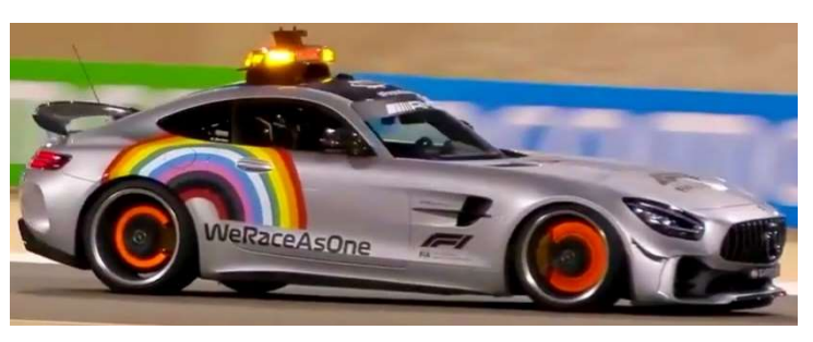
Drifting F1 Safety Vehicle, Mercedes AMG

Will SMG Drift Land provide a safe and regulated venue to drive or compete in a drift car, or to be a spectator?