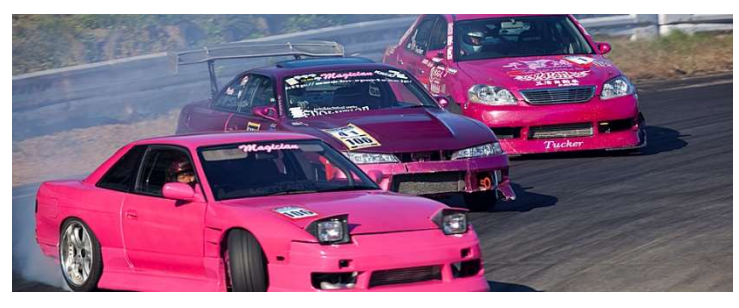
Iconic Japanese Drift Team – Magician Jzx110

As a motoring discipline, drifting competitions were first popularised in Japan in the 1970s and today are held worldwide and are judged according to the speed, angle, showmanship, and line taken through a corner or set of corners.