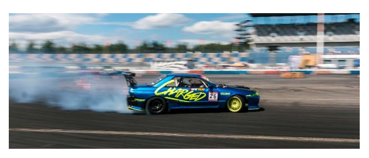
Drifting can be a competition or recreational sport