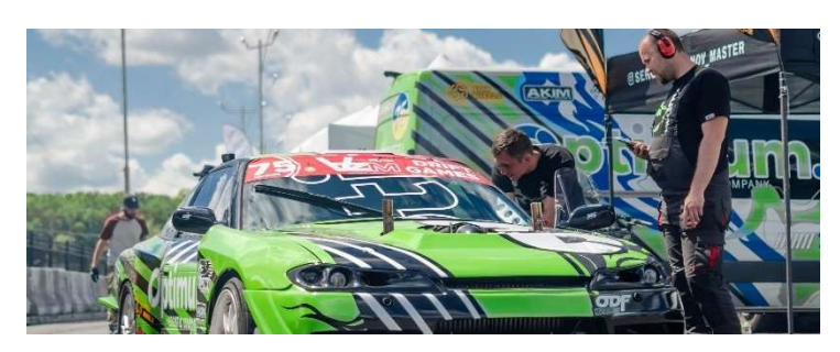
Competition drift car