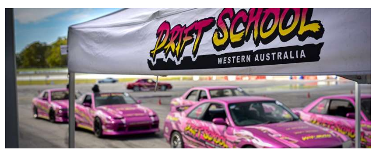
Drift School Western Australia performance vehicles

SMG Drift Land will deliver the above benefits and advantages to Western Australia in a safe space where people can enjoy Drift motorsport at a variety of participation levels