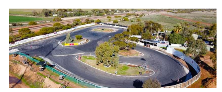
JDM X-Park Drift and Training Facility, South Australia

Help us get dangerous driving off the streets and into a dedicated drifting facility with best practice, education, exhilaration, and safety at the heart of its operations for motorsports enthusiasts young and old!