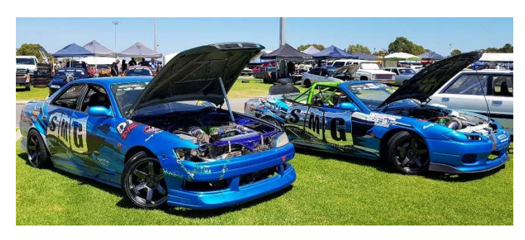
Secret Monkey Garage (SMG) performance vehicles

SMG Drift Land will be a professionally operated and controlled, specialist drifting facility, and unique motorsports tourism attraction in Western Australia.